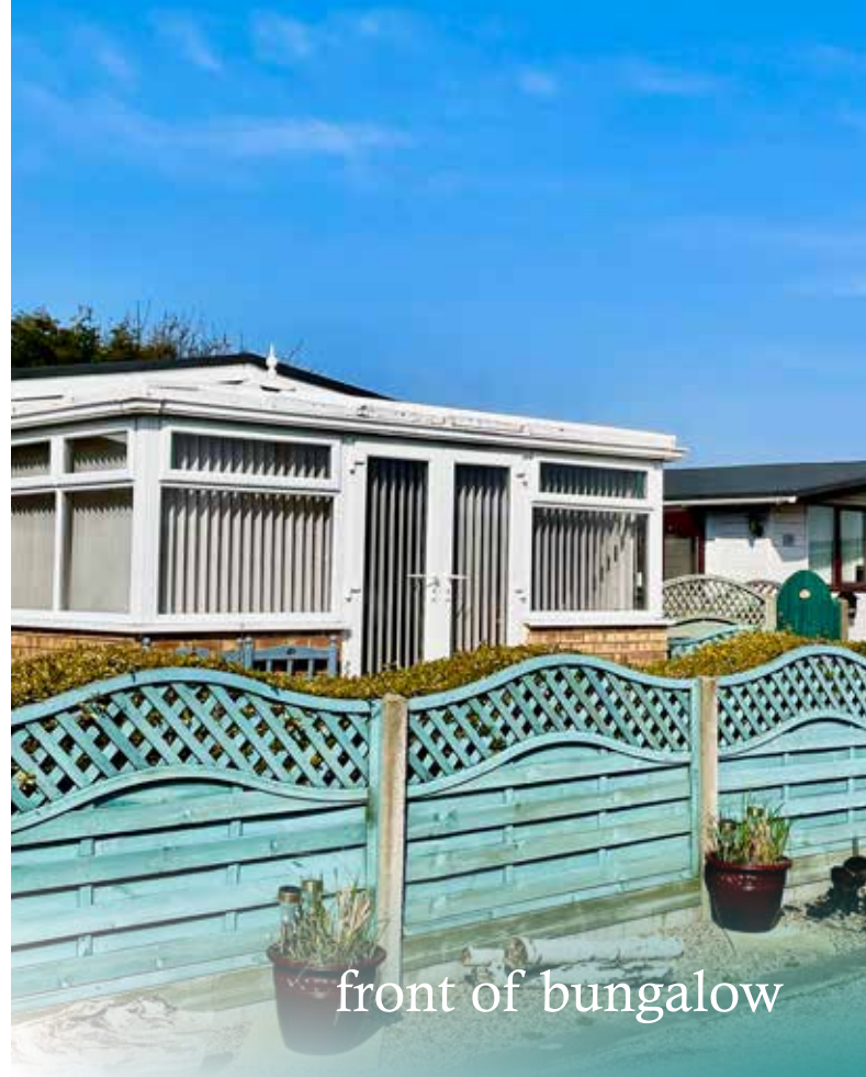
front of bungalow

The kitchen is well equipped with a large oven, hob, fridge and dishwasher, kettle, toaster and microwave, along with every pot, pan and utensil you'll need to cook up a feast.