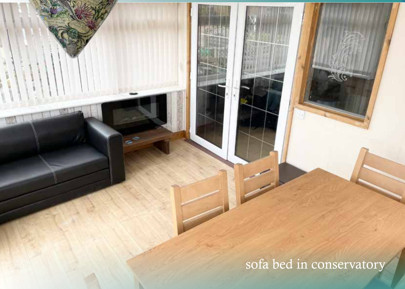
sofa bed in conservatory