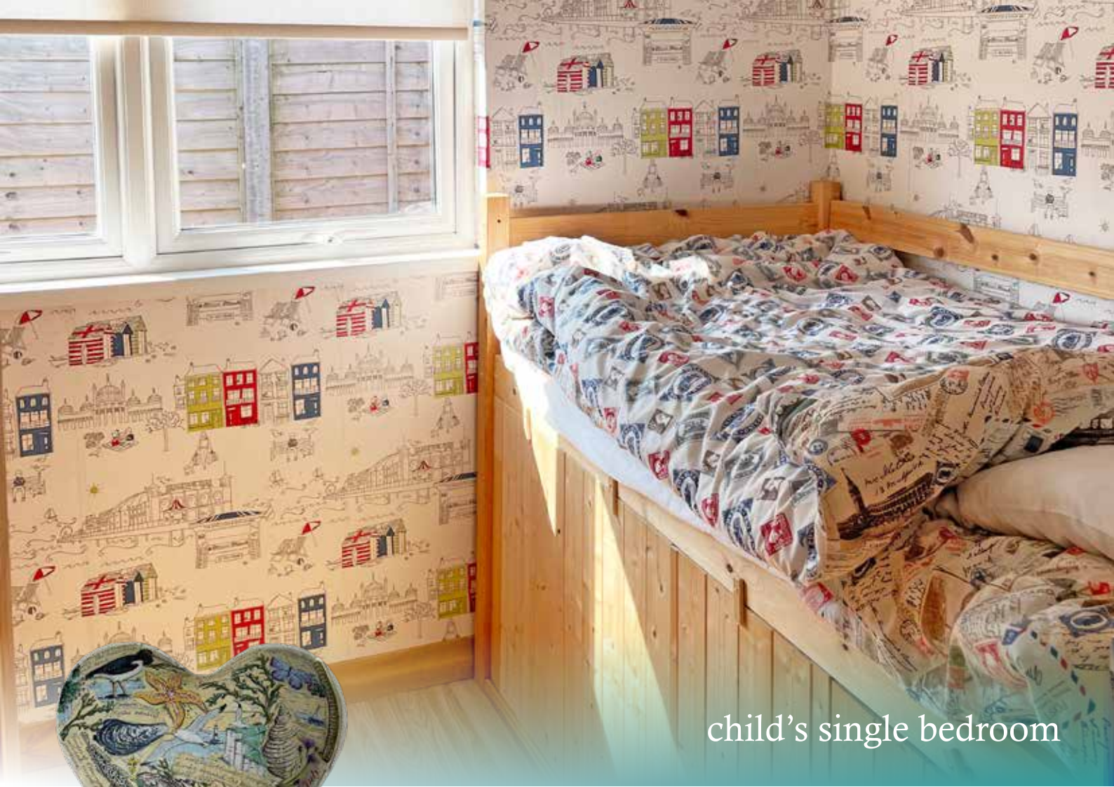
child's single bedroom